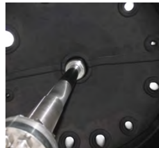
Rubber Lined Vessel

There are a variety of finishes available from mill finish to electro-polish. Plus, Steri can provide any coating or lining that your process demands.