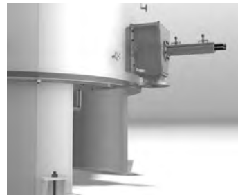
Fully Welded Insulation

There are several jacket design options available for your ZWAG filter. The jacket can be designed conventional, external half pipes or dimpled material rosette welded to the vessel. Insulation jackets can be fully welded to prevent environmental damage of the insulation. We install all types of insulation to better meet the demands of your application.