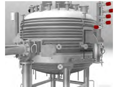
Half Pipe Jacket