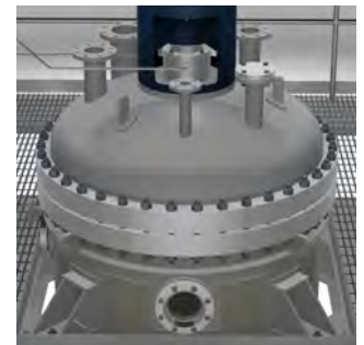
Body Flange Bolts

Bolts provide an economical option for maintain closure force on the gasket installed between the head and the filter vessel. Studs, each with a nut at the top and the bottom, are installed through an array of holes machined in the mating body flanges of the top head and the vessel. Steri provides the optimum bolt tightening torque values for the chosen gasket material. A variety of materials are available for the bolts and nuts as are a variety of coatings such as zinc, PTFE and others.