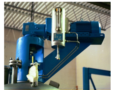
Side Mounted Electric Drive

Steri offers offset drives for height clearance or other issues. The standard offset drive consists of an electric motor mounted to specialized support frame and connected to the filter shaft through a right angle gear box. This direct connection eliminates the need for V-belts and complies with EU standards barring v-belt use.