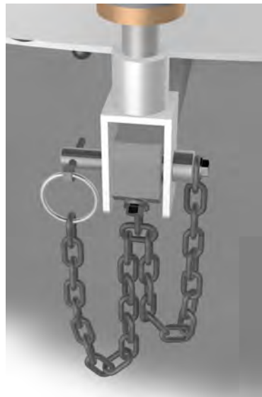
Dish Yoke & Clevis Pin

The fixed end of the cylinders are attached to lugs welded to the vessel by means of a pin. The moving end of the cylinder is attached to brackets on the dish by means of a yoke and clevis pin. Proximity sensors confirm complete engagement of the dish into the vessel. Hydraulic cylinders are used to raise and lower the dish on all ZWAG filters larger than 0.5m 2 .