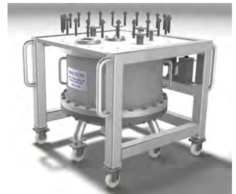
Body Flange Bolts