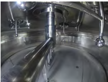
Custom Spray Ball Assemblies

Depending on your requirements, the clean in place components can be used during processing to aid in rinsing any product clinging to the walls and agitator.