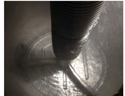
CIP Testing at Steri

First article testing can be performed using riboflavin to confirm total cleansing of all interior surfaces.