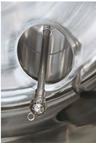
Cake Wash Spray Ball