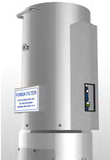
Purged Motor Cover

The FUNDA family of filter can be ordered with many accessories. Any accessory that your process requires can be designed in, right from the start. Additional spare nozzles can be added for later use to accommodate temperature probes or other components should the need arise in the future.