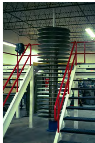
Nest Assembly Platform