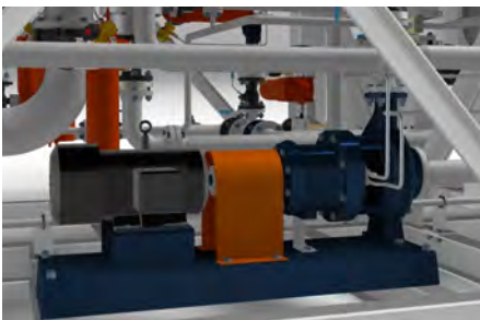
Explosion Proofed Pre-coat Pump