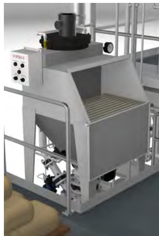
Bag Loading Station

Your process may need the addition of filter aid during the filtration step. You can take advantage of the decades of experience Steri has accumulated by having us design a pre-coat or body feed dosing system tailored for your process.