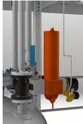
Automatic Valves Instrumentation Transmitters & Gauges

In sterile environments a purged motor protection cover can be installed. It provides a smooth, clean appearance and may be ordered with windows for observing gearbox oil levels.