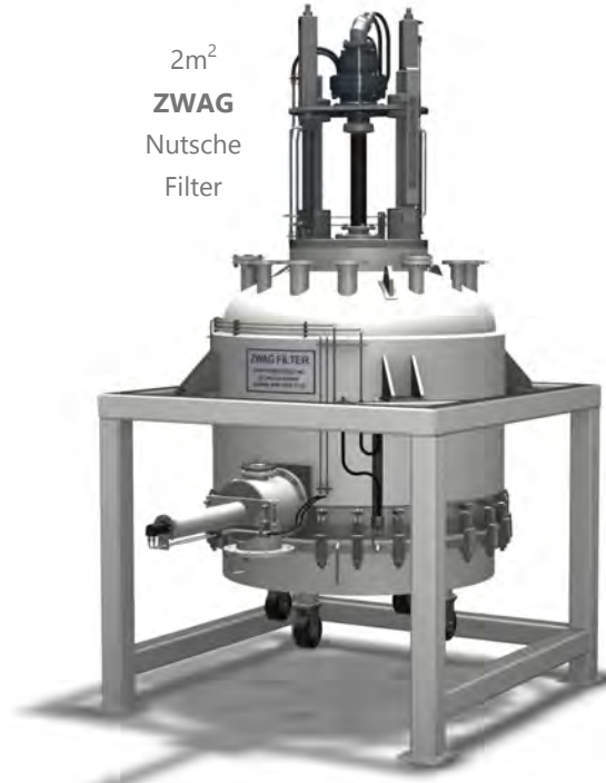
2m 2 ZWAG Nutsche Filter