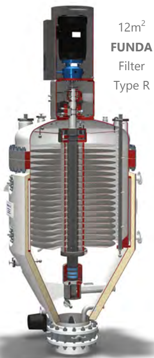
12m 2 FUNDA Filter Type R