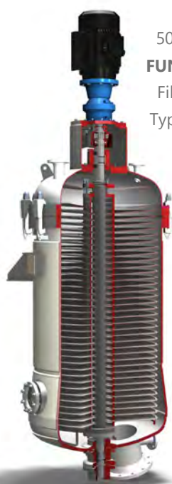
50m 2 FUNDA Filter Type A